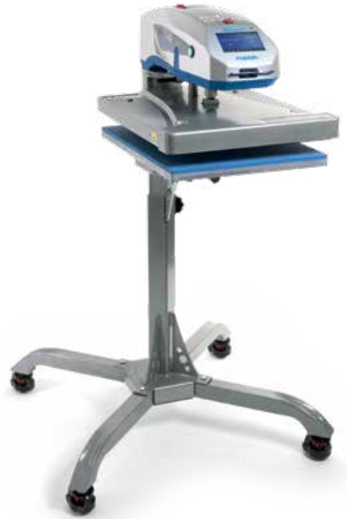
TABLE TOP AIR FUSION IQ®

Requires air compressor (not included) with minimum 1/2 horsepower and 2.5-gallon hold tank. Uses 2.3 CFM.