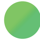
401 neon green