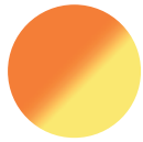
181 neon orange