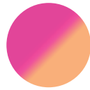
241 neon pink