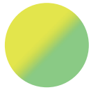
101 neon yellow